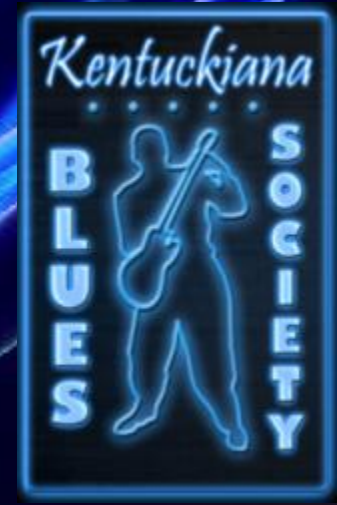
The Travlin' Mojos - c. 2009